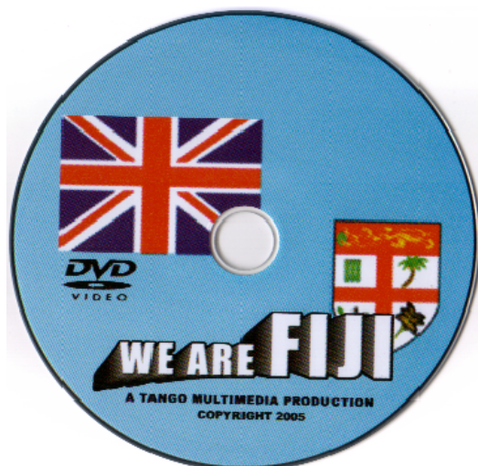
Figure 2 - The DVD disc design