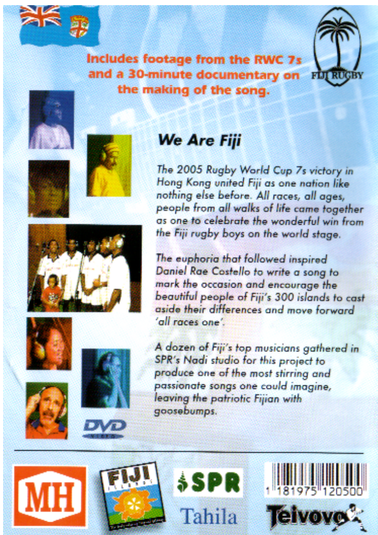
Figure 1 - The DVD back cover

Are Fiji , it is the anthem composed and sung in the language of Fiji's British colonisers that remains symbolic of Fijian national identity.